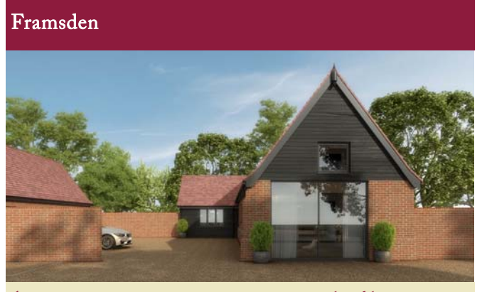
An exciting opportunity to acquire a part completed barn conversion occupying a site of nearly a third of an acre with pp to create a 3 bedroom single storey dwelling in a delightful rural location.