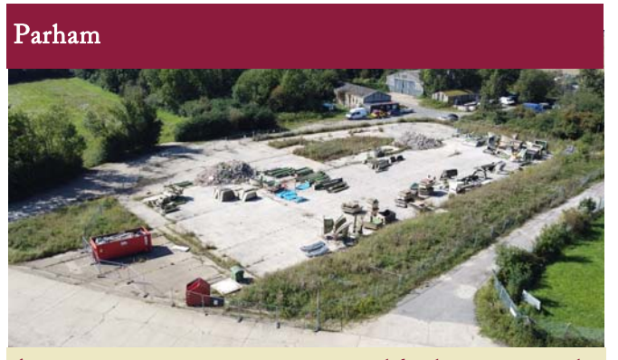
A rare opportunity to acquire a commercial development site with pp to construct a new building of over 24,500 sq ft (2,285 sqm) on a site nearing 1.25 acres (0.5 ha) in an established trading location a short distance from the A12.