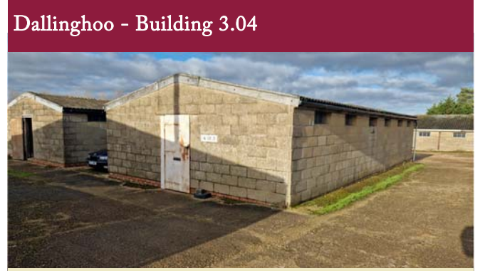
A storage premises in East Suffolk, located close to the A12 and the popular town of Woodbridge. A storage unit extending to 94.7 sqft (8.81 sqm) - situated in rural yet Suitable for a variety of uses, situated in a rural yet convenient location, just north of Woodbridge.