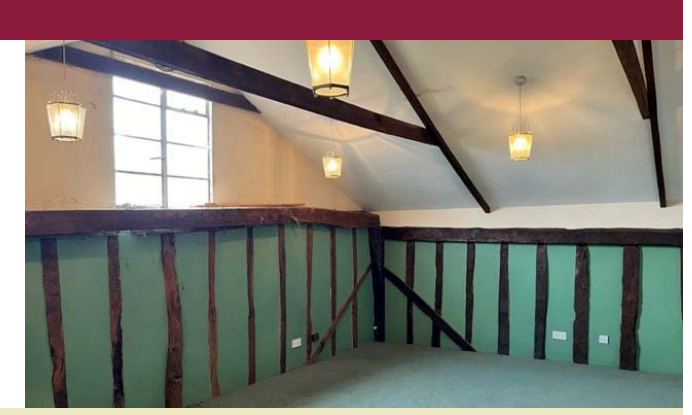
A traditional Suffolk barn, together with outbuildings, benefitting from pp for conversion to a four-bedroom dwelling with annexe, of over 4,500 sq ft, on a site of nearly half an acre, in the well regarded village of Stonham Aspal.